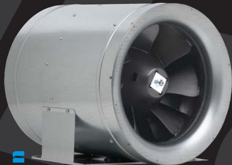
14 Inch Max Fan