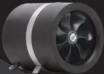
8 Inch Max Fan