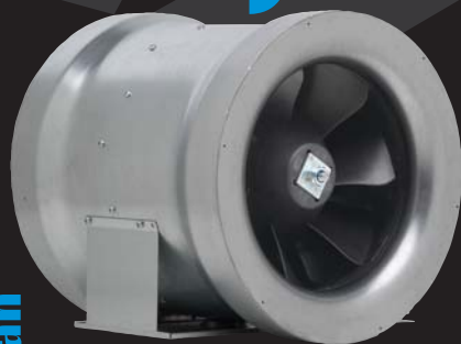
12 Inch Max Fan