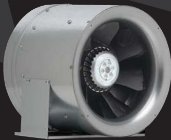
10 Inch Max Fan